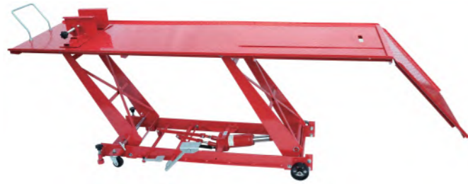
ZD04081 / ZD04101 / ZD04101D