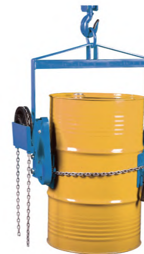
Special web sling as option.