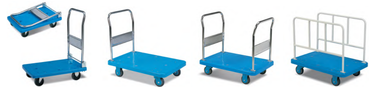
PC301A A-Foldable Handle PC301B B-Fixed Handle PC302C C-Two Fixed Handle PC302D D-Two Fixed Side Handle