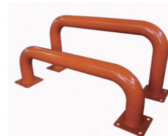
Machine Guards And Safety Bollards