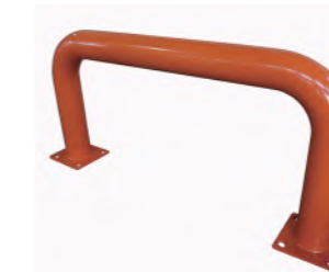
High-Profile Machine Guard