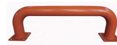
Low-Profile Machine Guard